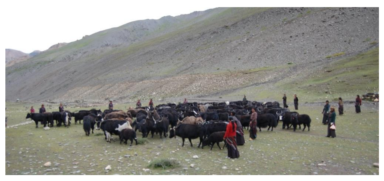
Mothers with their nak heards, Upper Dolpa

On September 22nd, 2020, the DZI again issued the donkey initiative with the donation seal of approval as we forward 100% of donations to the project.